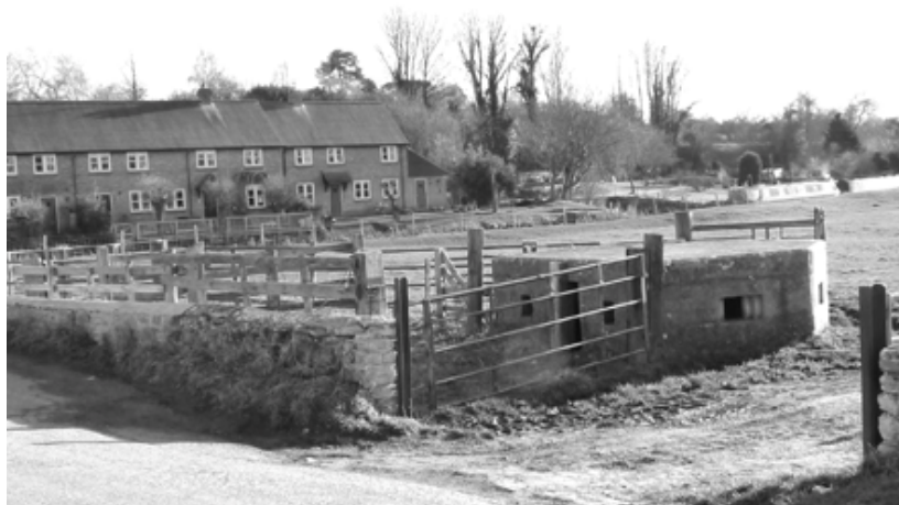
A pillbox at Somerton guarding the south side of the canal bridge

There are now very few examples of WWII architecture in the area. Air raid shelters and Observer Corps posts have been demolished and all that remains, beyond a few signs of old airfields (see p.92), are a pair of concrete pillboxes either side of the road from North Aston to Somerton. They guard the bridge over the canal in the foreground, the railway line and its bridge hidden behind the canal side cottages. The north side one is very similar. The embrasures would have given a good arc of fire for a machine gun along the approach road. No doubt there were also mobile road blocks (large tree trunks on wheels) as there were on each of the four roads into Deddington.