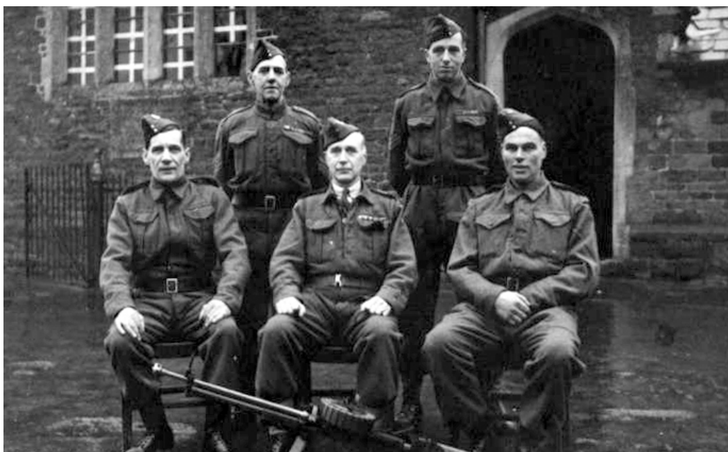
Lewis gun detachment - outside the Primary School