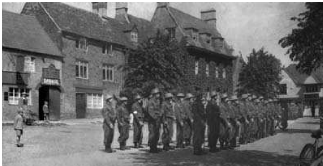
On parade in the Market Place

Affiliated to The Oxfordshire and Buckinghamshire Light Infantry