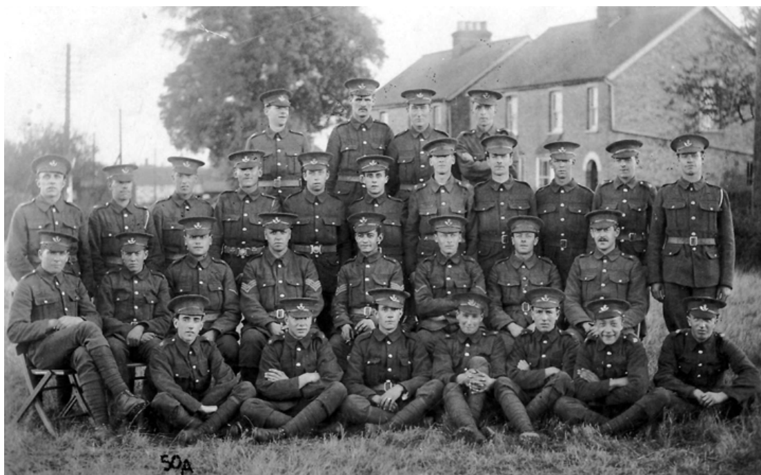
The Oxfordshire and Buckinghamshire Light Infantry, Banbury TA unit, 1914 - just before they were sent to France