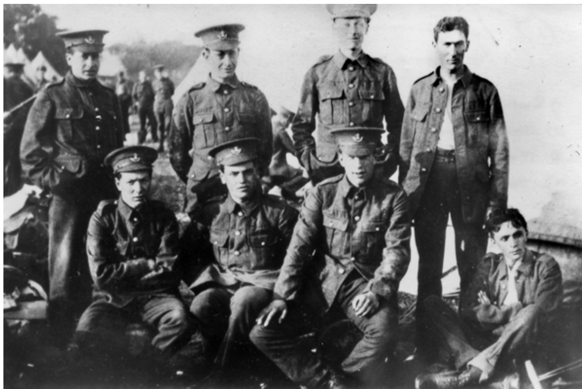
A group of Deddington soldiers

The Oxfordshire and Buckinghamshire Light Infantry, Banbury TA Company