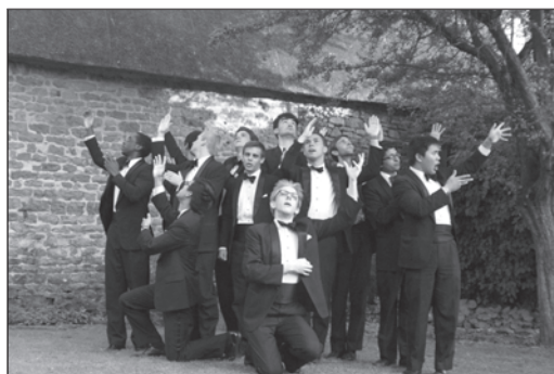
The wonderfully quirky Krocodiloes in full flight in an English country garden