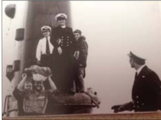
Members of HMS Alliance's crew

On conclusion of my final day at sea in command, as we approached harbour on the surface, I sadly consigned my sweater to the gash can (rubbish bin) and changed into shoregoing gear. A little while later, while in the Control Room looking at the chart for entering harbour, a cry went up, 'Captain is required on the bridge'. Thinking there must be a problem, I rushed up the ladder to the top of the conning tower to be greeted by the officer on watch with a broad grin on his face and his hand pointing down to the casing on which a small party of men, in submarine sweaters and caps, was assembled with a plank on their shoulders on top of which was a white ensign with what looked like a large box underneath.