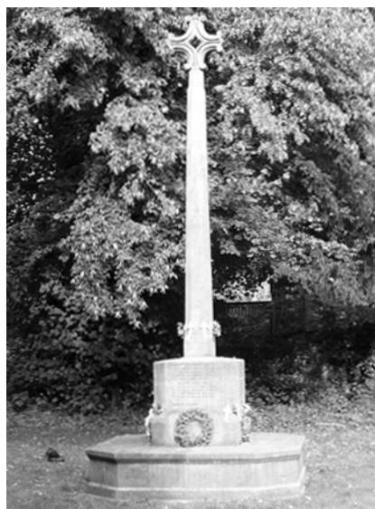
The Croughton War Memorial stands in the north east corner of the churchyard