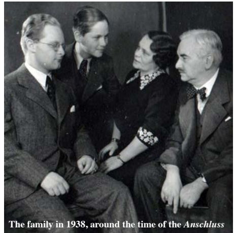
The family in 1938, around the time of the Anschluss