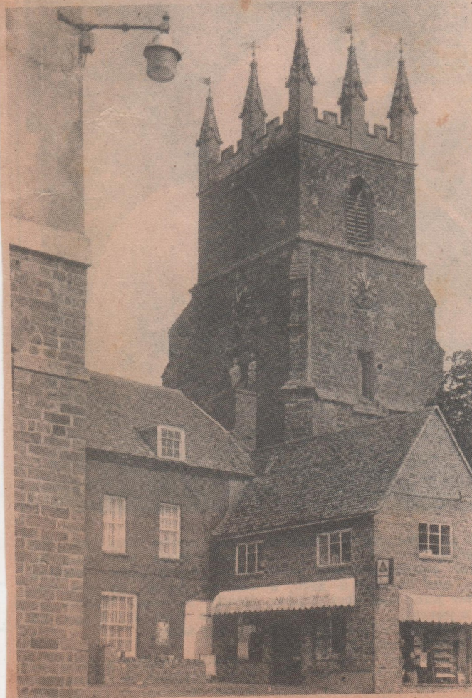
Deddington — venue for a week long festival.

Prime movers in the Deddington Festival, which includes Clifton and Hempton, are the Deddington Society, but it worked out as a community enterprise with everyone working together to make this festival a big success.