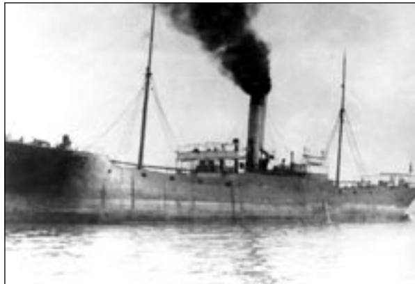
The former SS Deddington, later County of Cardigan