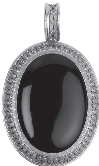
A Victorian onyx and enamel memorial locket pendant by Phillips Brothers & Son, circa 1870 Sold for £1,900 - March 2018

Valuation mornings in Oxford by appointment on: