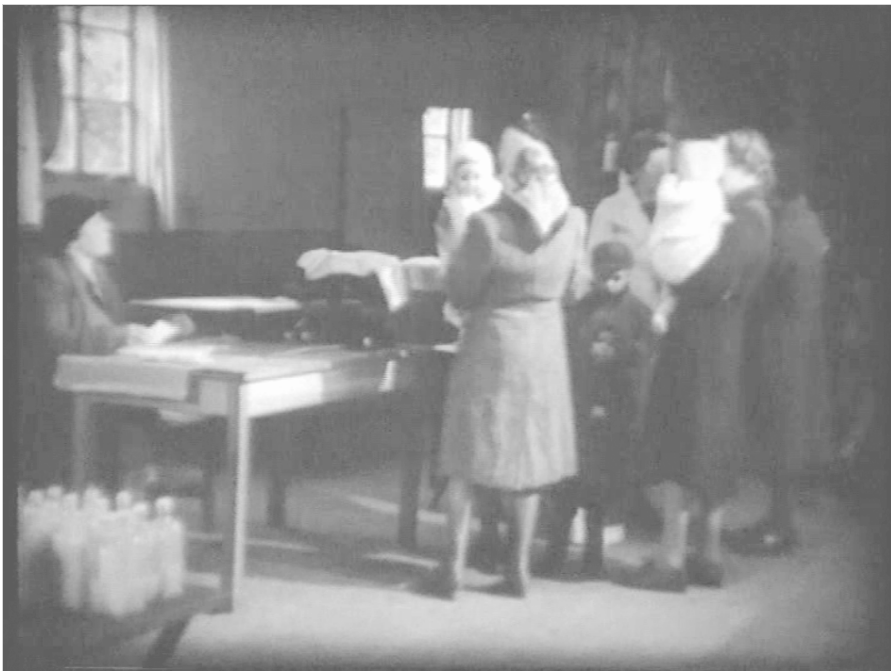
Above and below: The infant welfare service and The child medical service at Swalcliffe Village Hall.