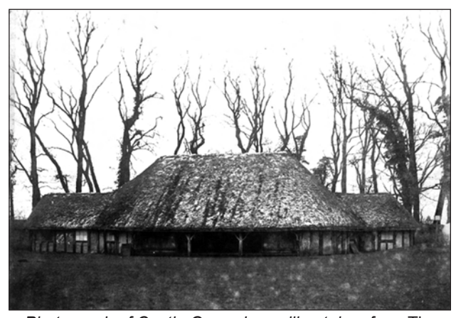
Photograph of Castle Grounds pavilion taken from The Story of Deddington by Mary Vane Turner