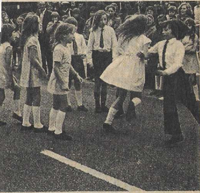
Children pictured giving a display of country dancing at the Deddington Festival. In the background, one of the old steam engines on show.