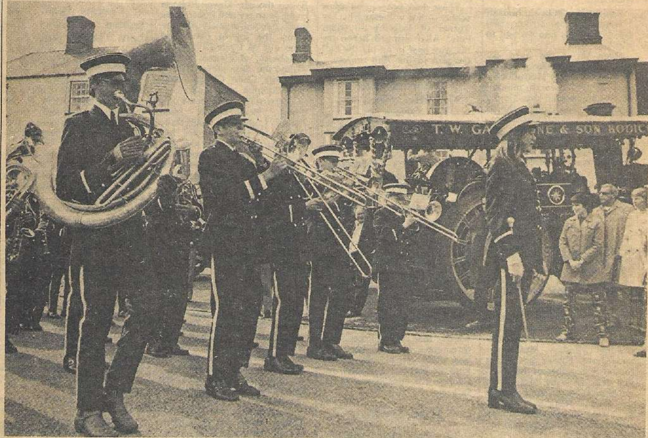
Plenty of puff from young and old at Deddington Festival on Saturday — a turn-of-the-century traction engine and youngsters from Upper Heyford High School Band.