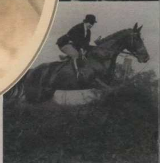
PHANTOM FOX TEAM