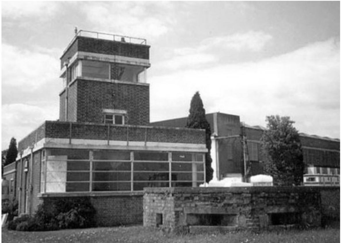
Bicester airfield - 2001 WWII Control Tower and Gun Emplacement