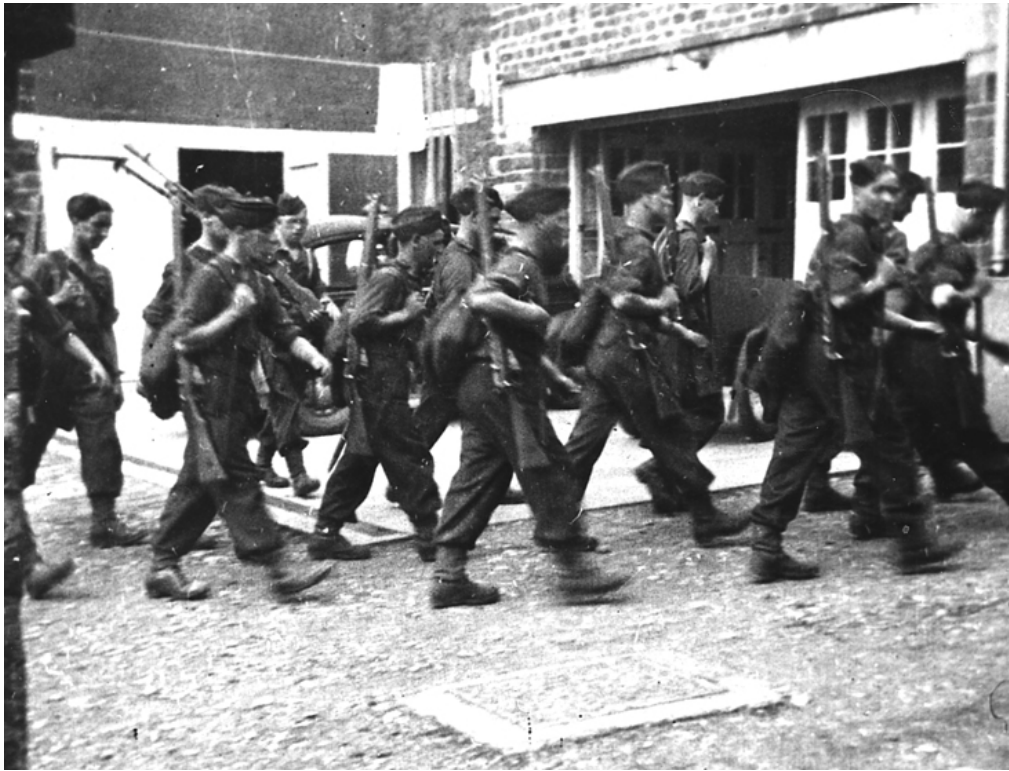
Soldiers billeted at Deddington House marching out of the courtyard