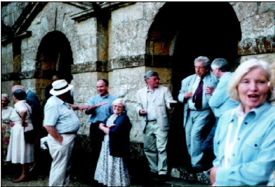
Our first year included two 'non-lecture' events, something we are working on for the 1999-2000 programme.