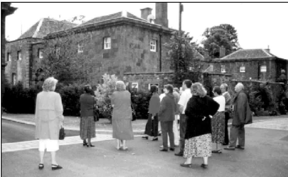
These pictures show (above) members and friends enjoying a warm summer evening and the cold bubbly at Rousham Park and (below) as guests of the Adderbury History Society, in the gentle autumn rain on a conducted walk.