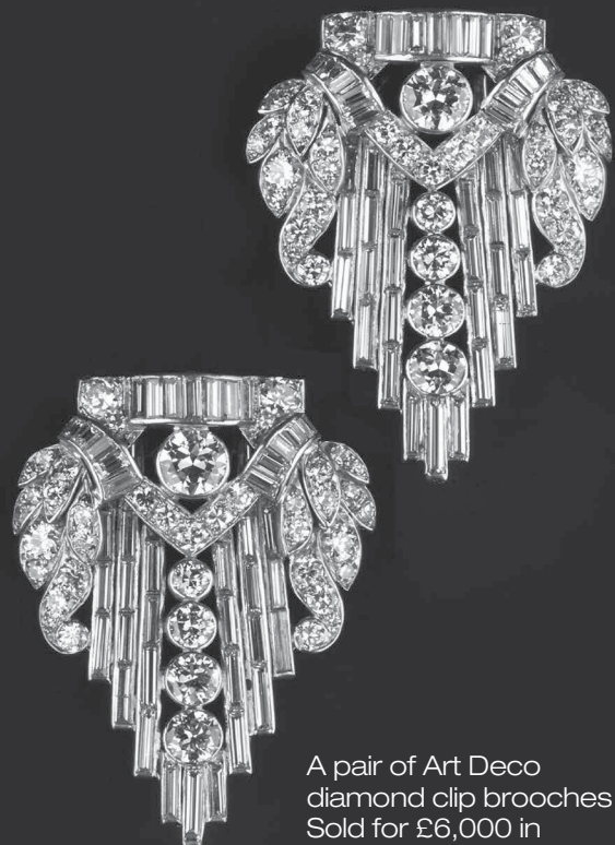
A pair of Art Deco diamond clip brooches Sold for £6,000 in November 2017

Mallams Auctioneers, Bocardo House 24a St. Michael's Street, Oxford OX1 2EB